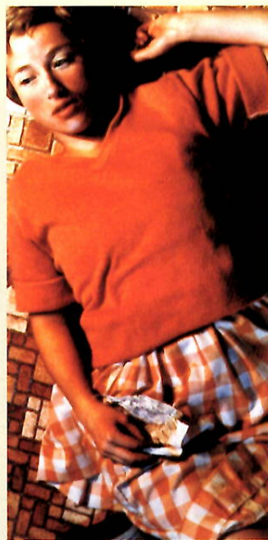
Untitled #96 by Cyndy Sherman, 1981, C-print, 24" x 38"

Art and Cultural Center of Hollywood 1650 Harrison Street, Hollywood www.artandculturecenter.org