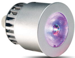
ILUMINARC® Ilumipod LQgic Tri-1

Ashford Estate installed interior lighting solutions from the ILUMINARC® Logic system, which seamlessly blended into the architecture. The energy efficient fixtures add elegant colors and, at times, a dramatic ambiance for a variety of weddings and private functions held at the estate.